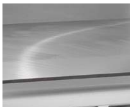
Thick highly polished steel griddle plate maintains selected temperatures.