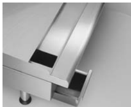
Stainless steel grease gutter and 1 gal. (3.8 L) grease can.